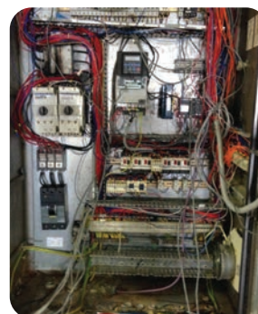
Old Outdated System